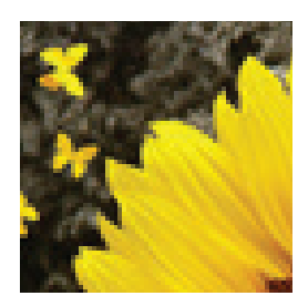
raster art - zoomed in